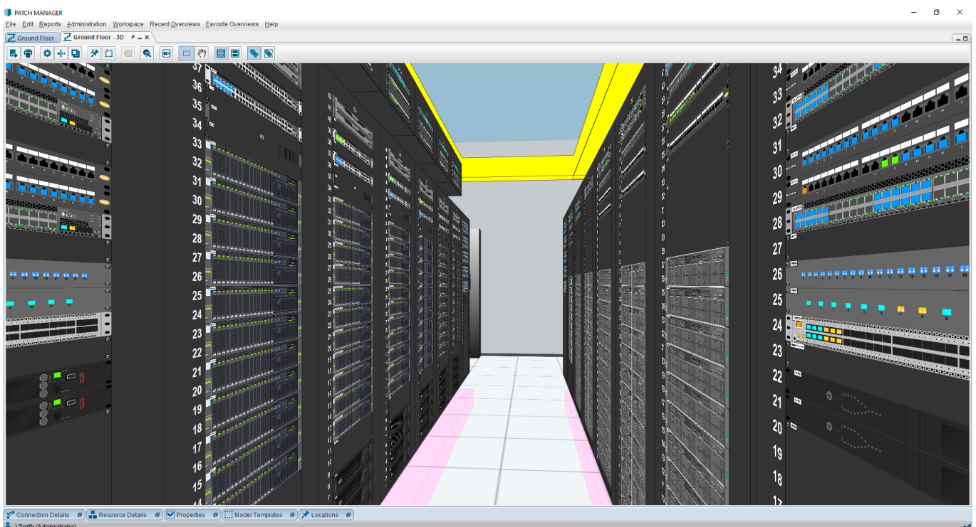
PATCH MANAGER data center 3D overview