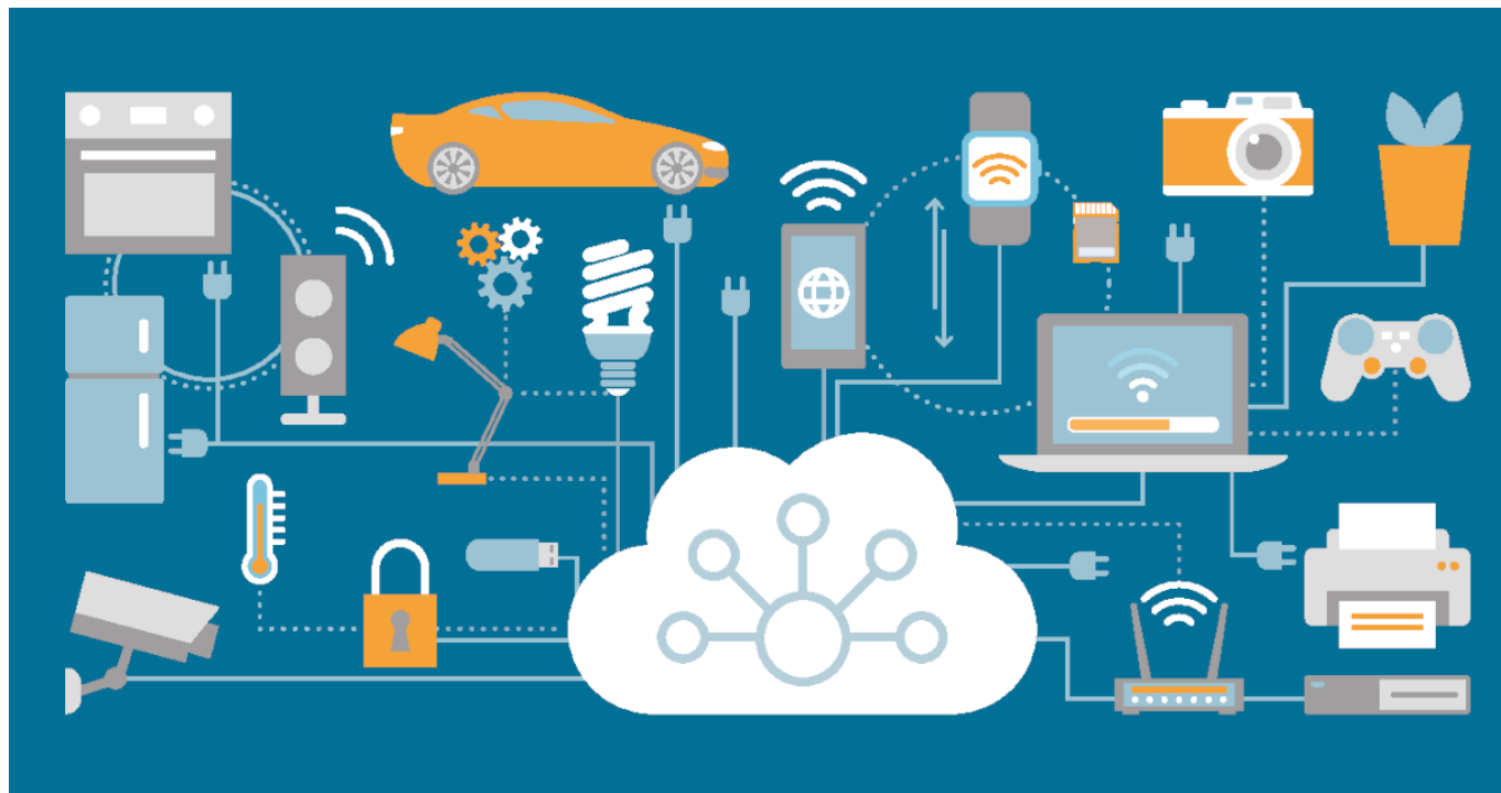
Image 1: IoT illustration

The data center industry faces several challenges due to the rapidly changing landscape of technologies and the dramatic increase of data that these new technologies bring. The challenges include, but are not limited to the Internet of Things (IoT), Artificial Intelligence (AI), Edge Computing and recently, the emerging 5G technology. In this article, we focus on the impact of IoT on data centers and propose the implementation of a Data Center Infrastructure Management (DCIM) solution as a mechanism to help address the challenges.