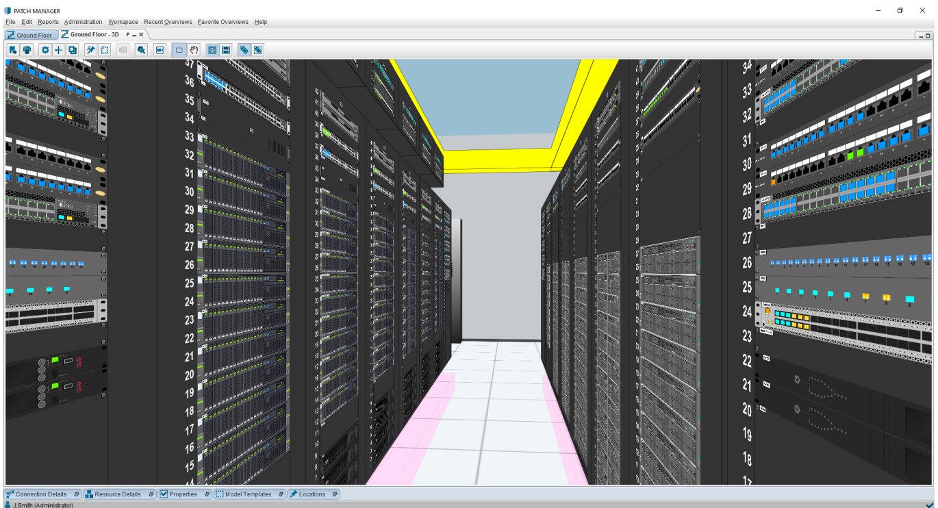
PATCH MANAGER data center 3D overview